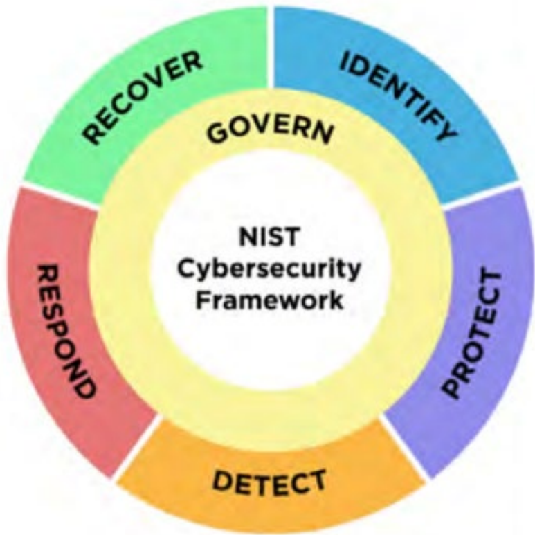
The six Core Functions of the NIST Cybersecurity Framework. Courtesy: NIST .